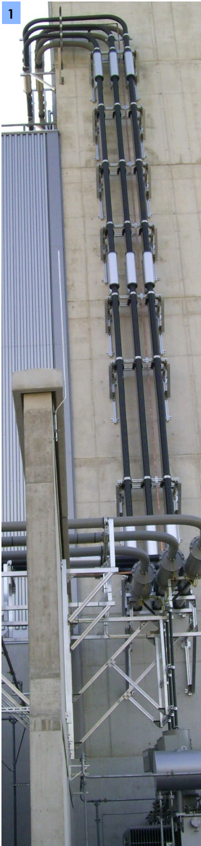
1 GuD Linz / Austria (Photo 1)

No additional protection is needed for outdoor application.