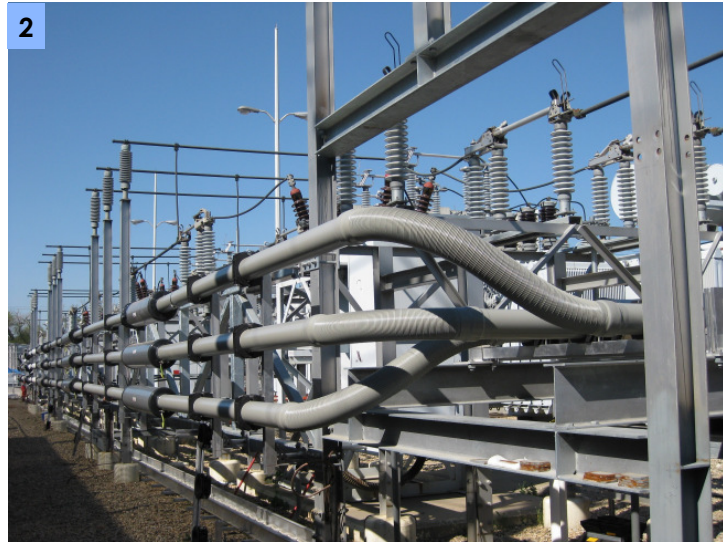
2 72,5 kV EPCOR / Canada (Photo 2)

No additional protection is needed for outdoor application.