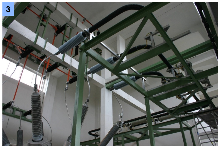
3 110 kV UW Kolin / Czech Republic (Photo 3)

Duresca® in a H.V. application and in outdoor installation.