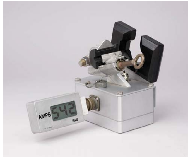
LL-230 with Display attached